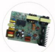
upgrade driver board