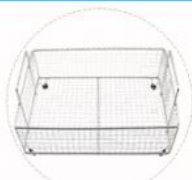
sus basket (optional)