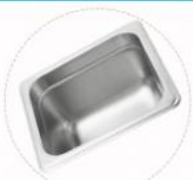
tank size :330 x300x150